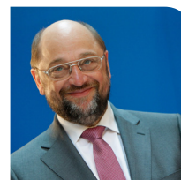
MARTIN SCHULZ President The European Parliament

The opportunity to grab the metaphorical bull by the horns is therefore there. The danger is that if the mainstream is unwilling to step up to the task citizens will continue to be tempted by the tantalisingly simple solutions offered by populist, racist and xenophobic politicians. ■