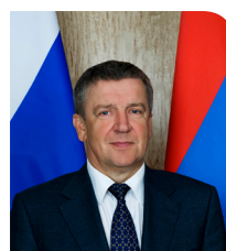
ALEXANDER KHUDILAINEN Head The Republic of Karelia Russia

In 2020 Karelia will celebrate the 100th Anniversary of its statehood. The FTP is a unique opportunity for a quality change of the socio-economic situation in the region. Karelia has to do its best to open the potential, mark itself on the map of Russia as a bright, strong and competitive territory. We are sure that we can gain it and we are open for cooperation. ■